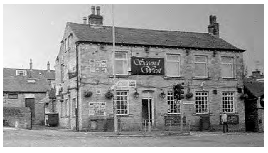
The Second West public house

Felo de se, Latin for "felon of himself", is an archaic legal term meaning suicide. In early English common law, an adult who committed