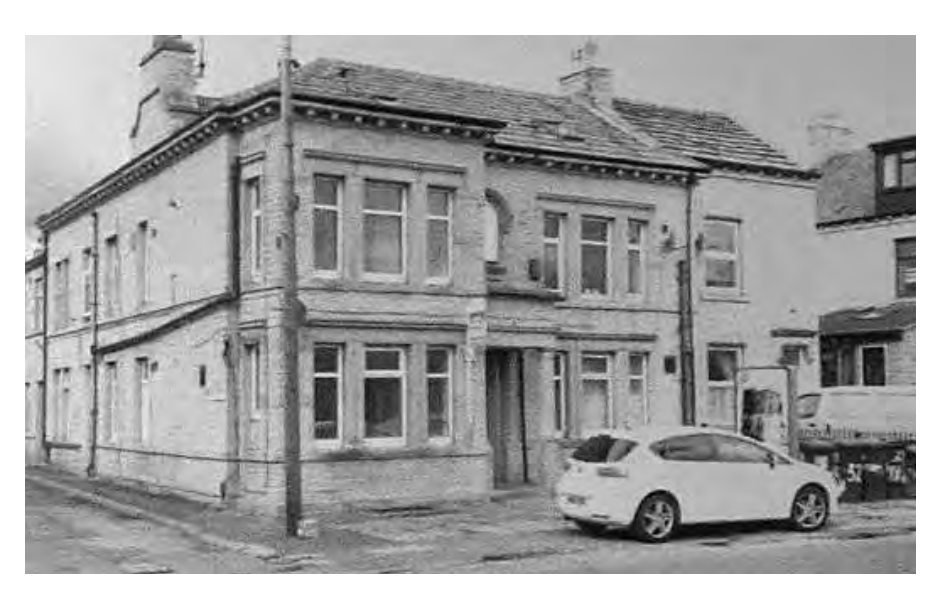
The former New Miller's inn

suicide was literally a felon, and the crime was punishable by forfeiture of property to the King and what was considered a shameful burial (typically burial at a crossroads with a stake through the heart). A mentally incompetent person, however, who killed him or herself was not considered a felo de se, and was not punished post-mortem for his or her actions. In 1823 a new law was passed which made it illegal for coroners to issue a warrant for burial of a felo de se in a public highway. However, within twenty-four hours of the inquest the suicide was to be interred in a churchyard or public burial place. The new law also included other punitive clauses, namely that the burial should be without Christian rites and at night between the hours of nine and midnight, and his or her goods and chattels must still be surrendered to the Crown. It was not until the 1880s that suicides could not be buried in consecrated ground.