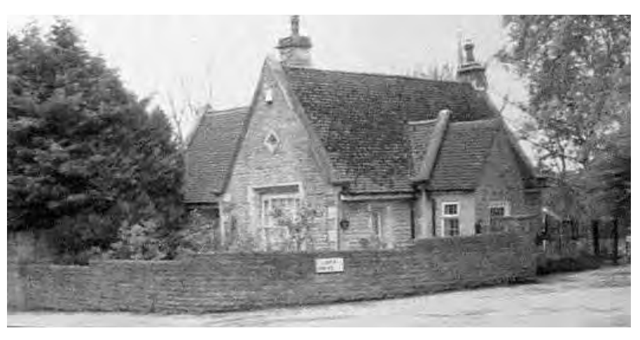
"Ferncliffe" Lodge, Clara Drive

The next we hear of the family is in 1881, when they feature in the UK Census living at "Ferncliffe", West Lodge, Calverley. Whilst describing himself as a retired Police Officer,