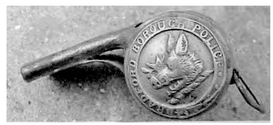
Left: Bradford Police cap badge. Right: Victorian Bradford Police pocket whistle

However, in lieu of pay he was permitted to retain fees paid for serving summonses, executing warrants and conveying prisoners to Wakefield goal. Effectively, this marked the beginning of the Bradford Police Force.